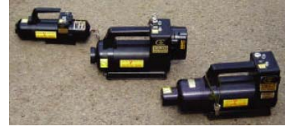
A range of X-ray sources