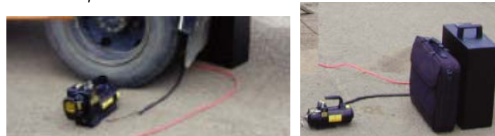
Find narcotics hidden in vehicle tires