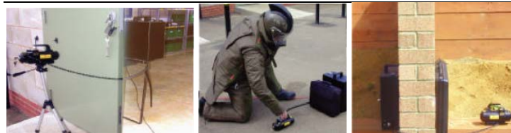
Search behind walls, doors or vehicle panels