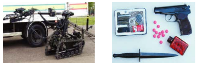
Works with ROV's